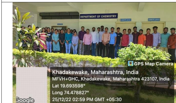
Photo Session at Department of Chemistry