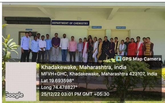
Photo Session at Department of Chemistry