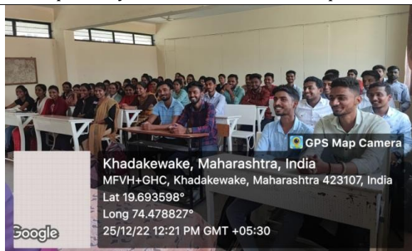
Alumna Present for Meet